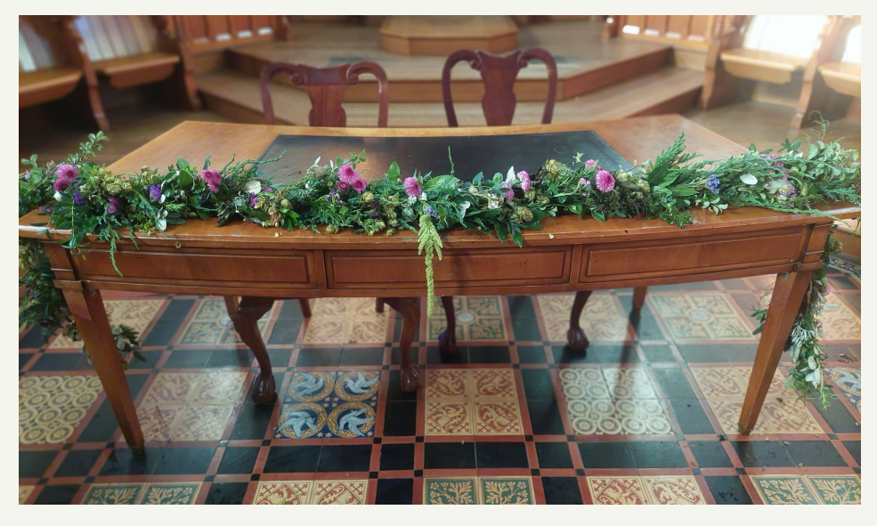
Camomile & Cornflowers Stanbrook Abbey, Worcester