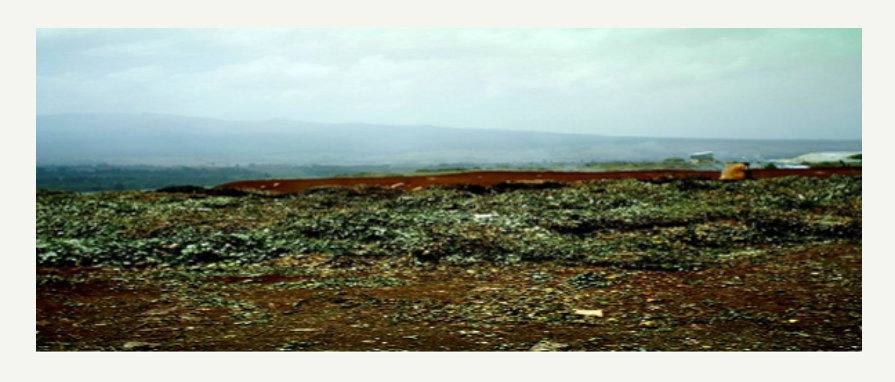
POOR DISPOSAL OF WASTES FROM FLORICULTURE FARMS IN ETHIOPIA

PESTICIDE SPRAYING IN ETHIOPA LARGEST ROSE GROWER IN THE WORLD