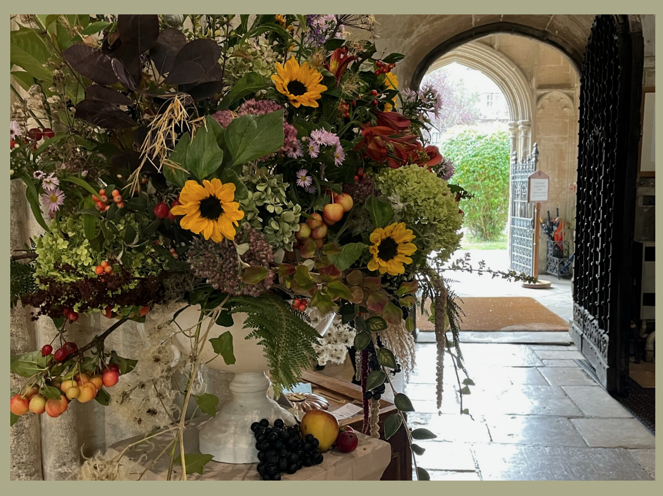
Honeymoon farm St Mary's Church Fairford