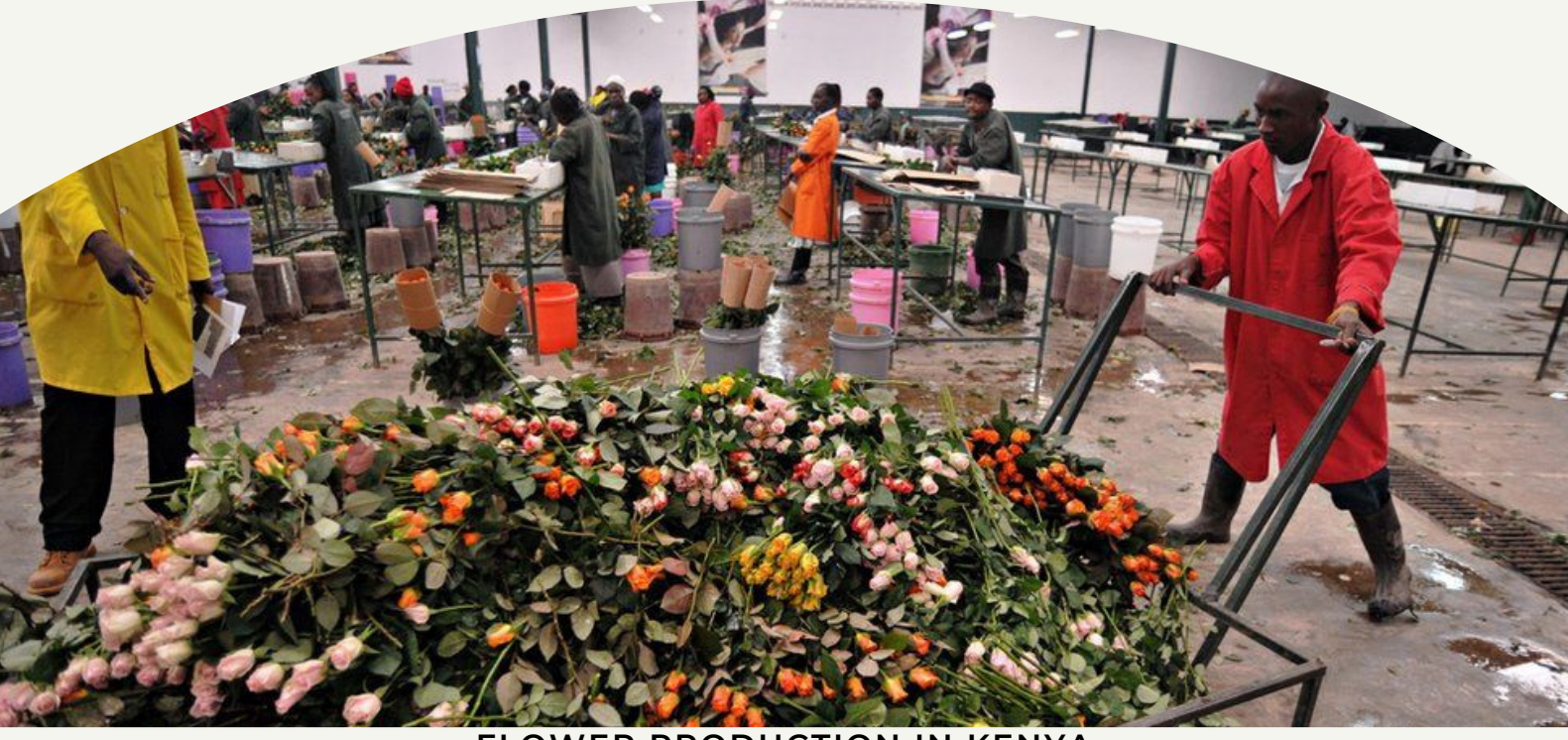
FLOWER PRODUCTION IN KENYA